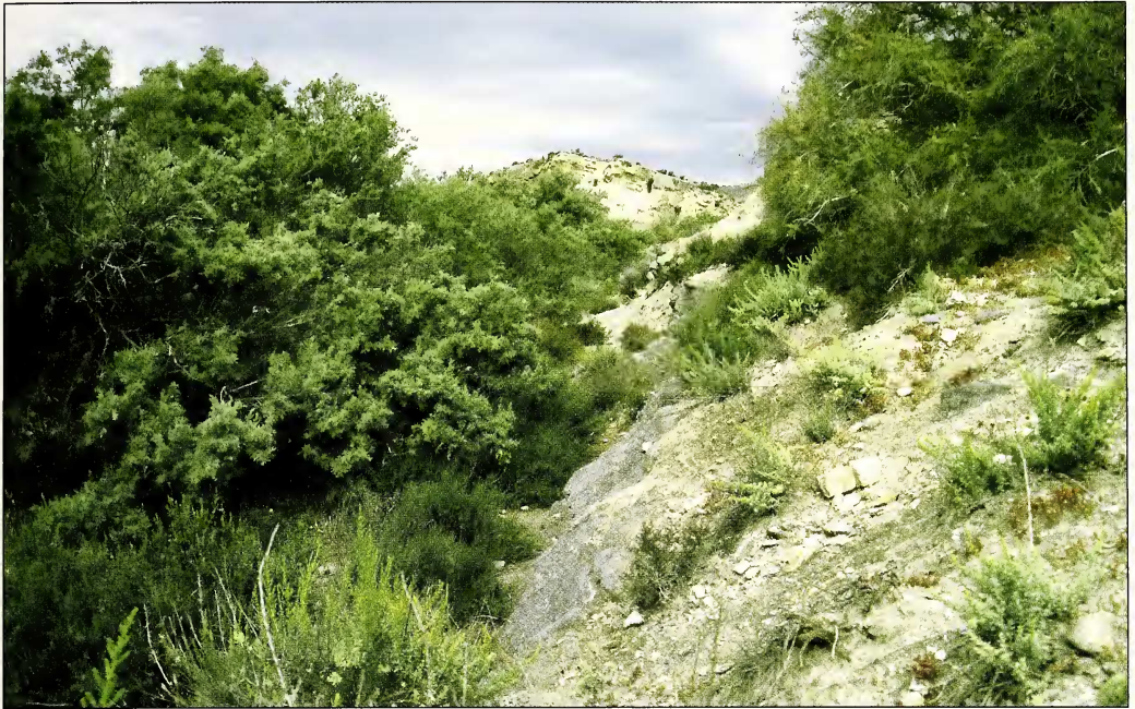
Fig. 17. Habitat of Menophra annegreteae sp. n. Tabernas.

The male genitalia of S. bastelicaria (Figs 11–12; n = 3) differ from those of S. fortunaria (Figs 9–10; n = 3) in the smooth surface between the outer process and apex of costa of the valva? (this surface is jagged with small broad spines in S. fortunaria ). Moreover the juxta is less constricted medially and the pointed apex of the aedeagus is shorter. The female genitalia of S. bastelicaria (Fig. 15; n=2) and S. fortunaria (Fig. 14; n=2) are rather similar to each other and differ mainly in the sclerotisation adjacent to the ostium.